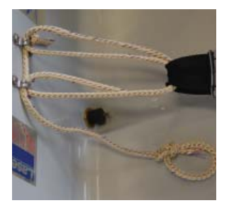
10 Tie a loop handle in the end.

The rope tail is then passed through the starboard eye so that the end of the V12 can be pulled from the side of the boat.